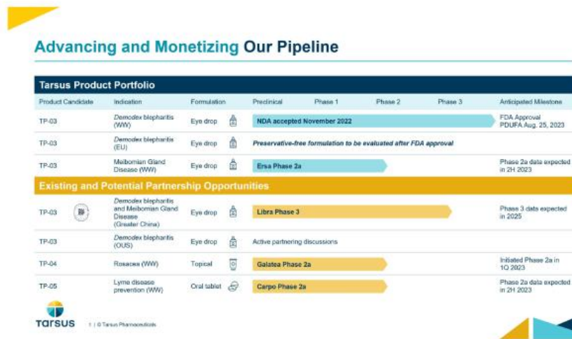
Figure 1: Pipeline Chart

WW Worldwide EU European Union OUS Outside the U.S.