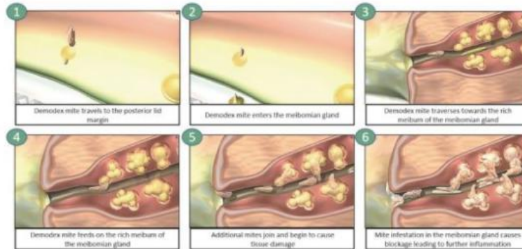
Figure 6: Demodex Mites Infesting the Meibomian Gland

The following figures illustrate a representation of Demodex mites infesting the meibomian gland: